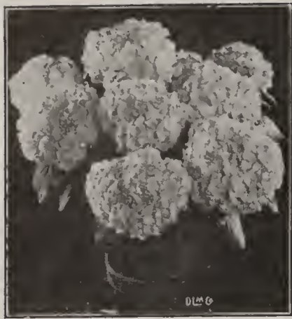
HYDRANGEA, FRENCH BLUE (See page 3)